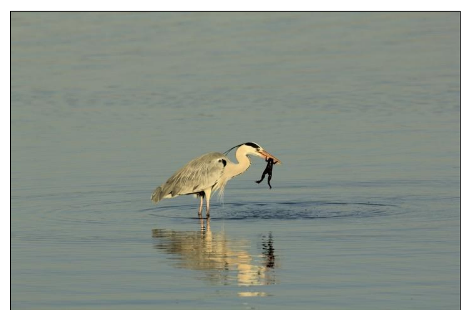
A grey heron enjoying a platanna.