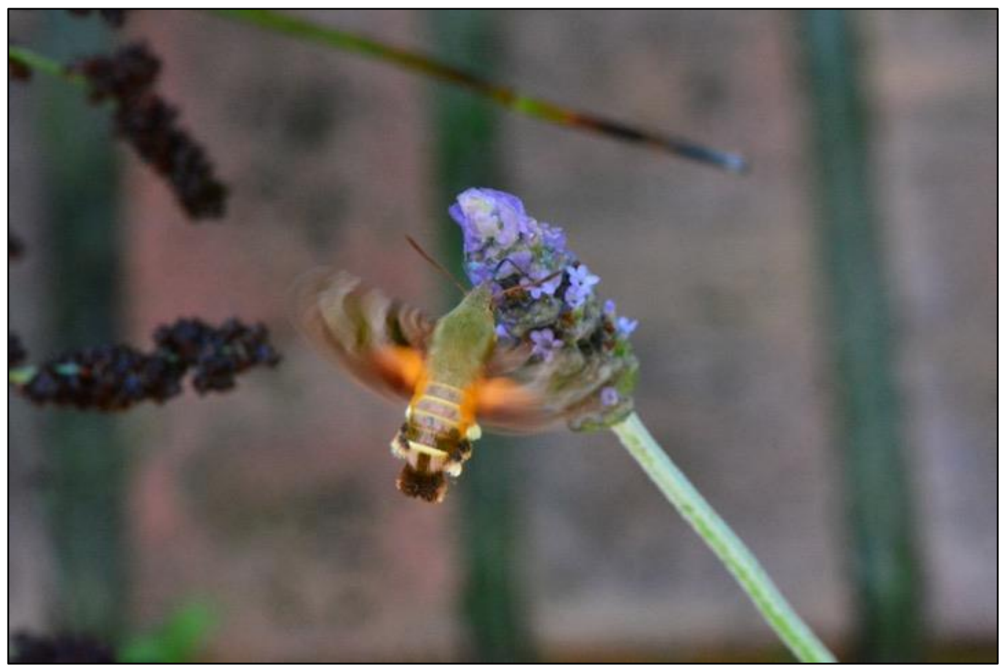
Some micro wildlife (African hummingbird hawk moth) amongst the lavender in our garden this morning.