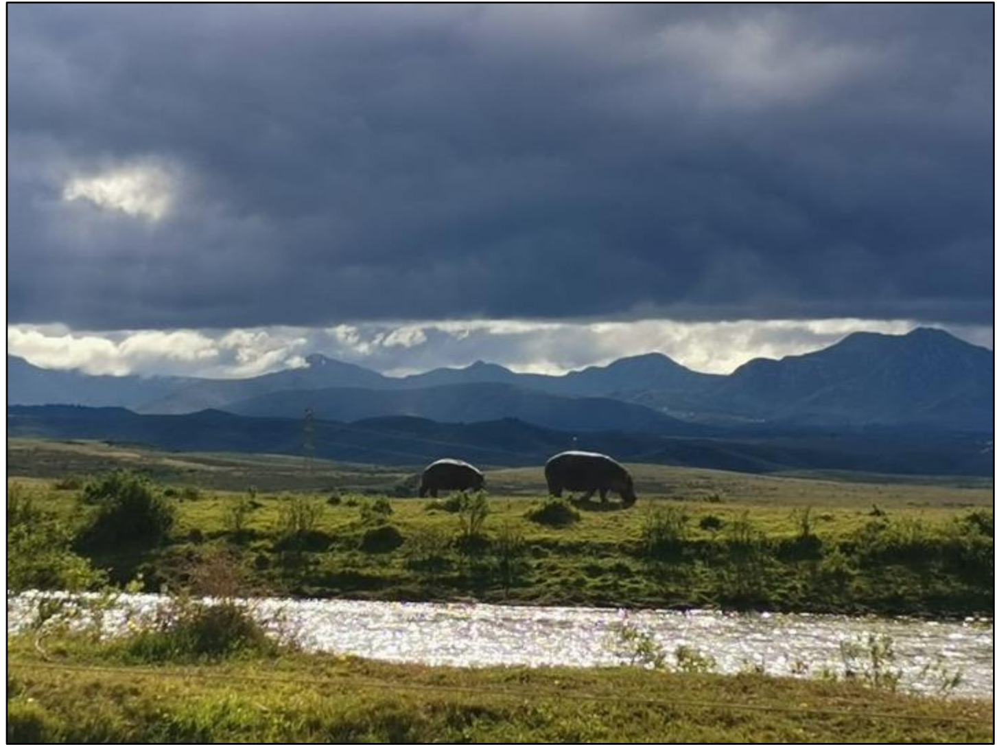
Hippos in Mossel Bay

You can also listen to this interview on Cape Talk" <u>https://www.capetalk.co.za/podcasts/127/lunch-with-pippa-hudson/335135/bambi-the-hippo-finds-a-new-home-and-a-new-friend</u>