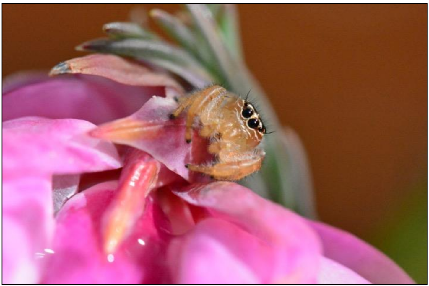
Cute little spider on my Erica glauca var elegans.