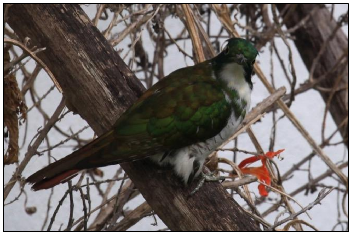
Yesterday's visitor to the vegetable garden – a Klaase's cuckoo.