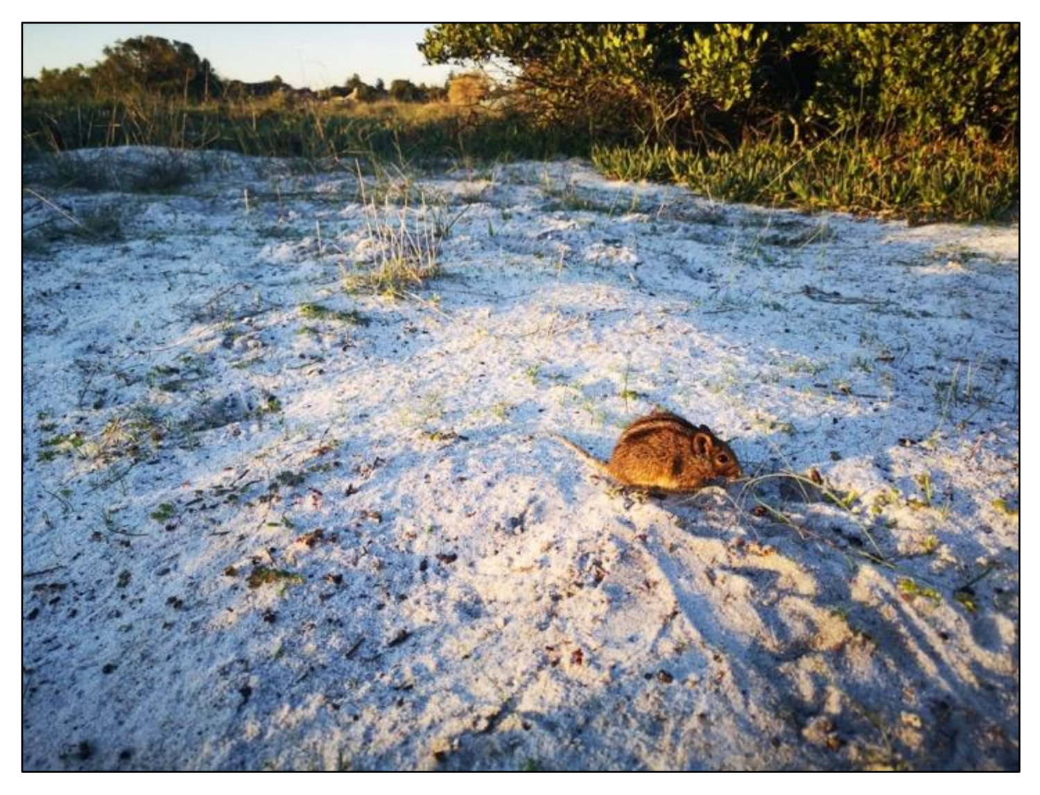
As about as close as one can get to a striped field mouse