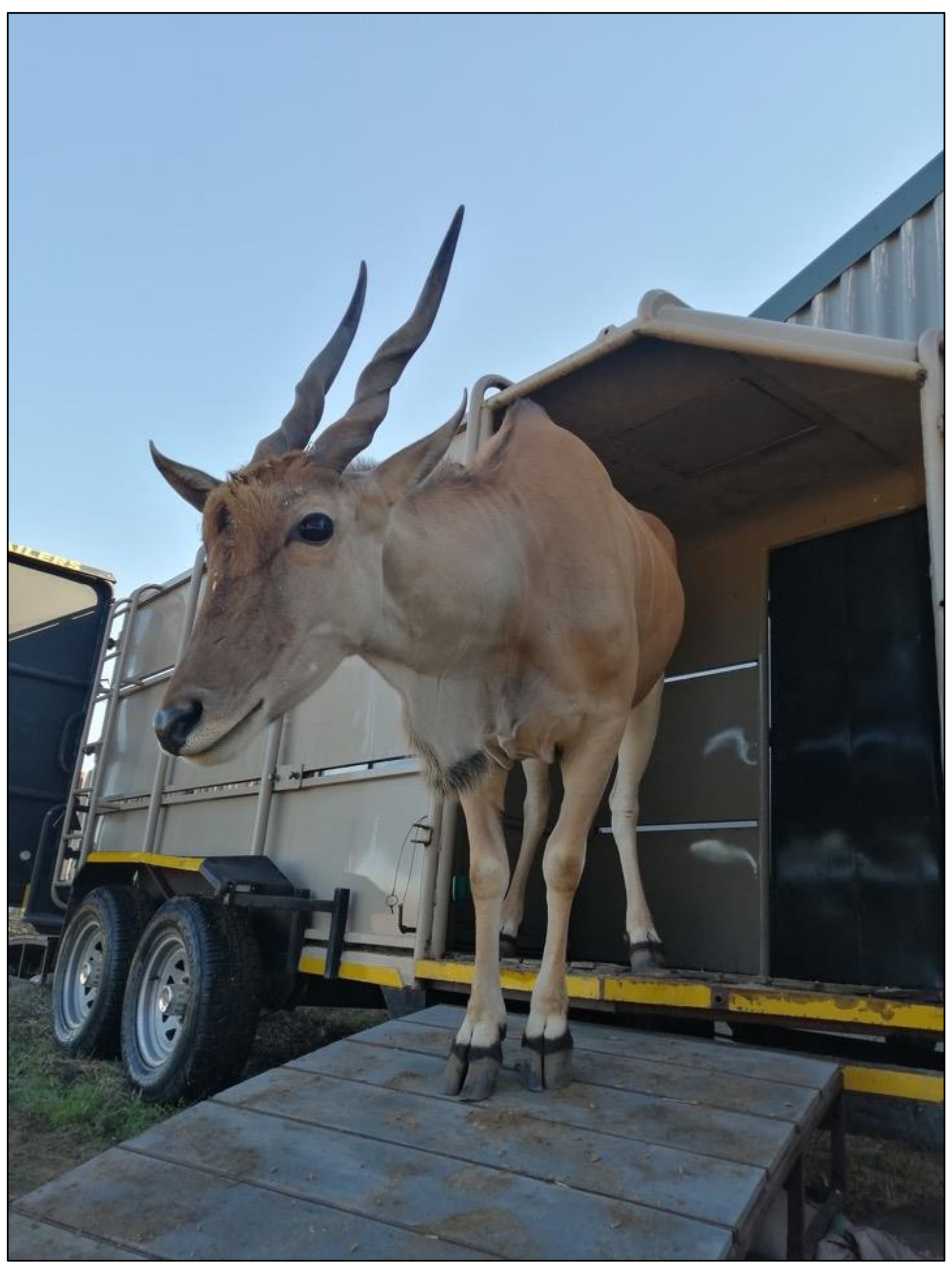
Berni in trailer training